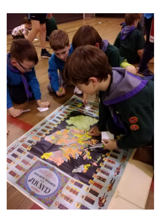
SCOUTS - MISC - GROUP EXEC - UPDATE - SPRING 2022